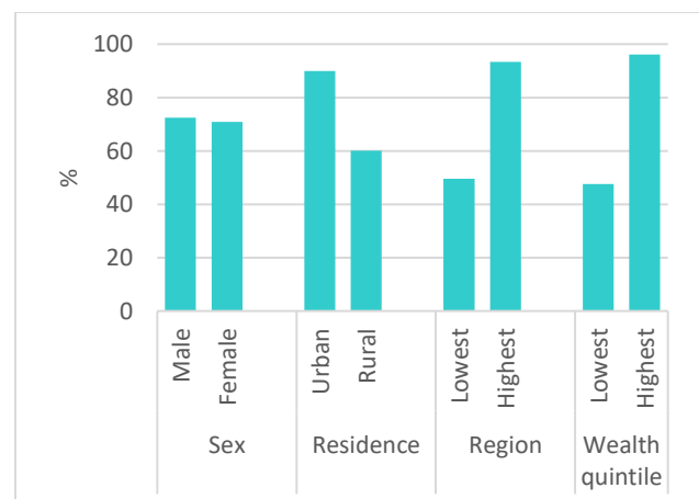
Figure 2: Birth registration by background characteristics, Côte d'Ivoire, 2016