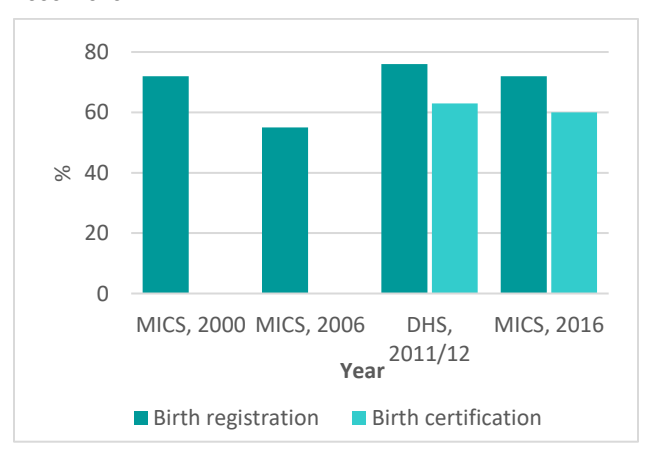
Figure 1: Birth registration and certification, Côte d'Ivoire, 2000–2016