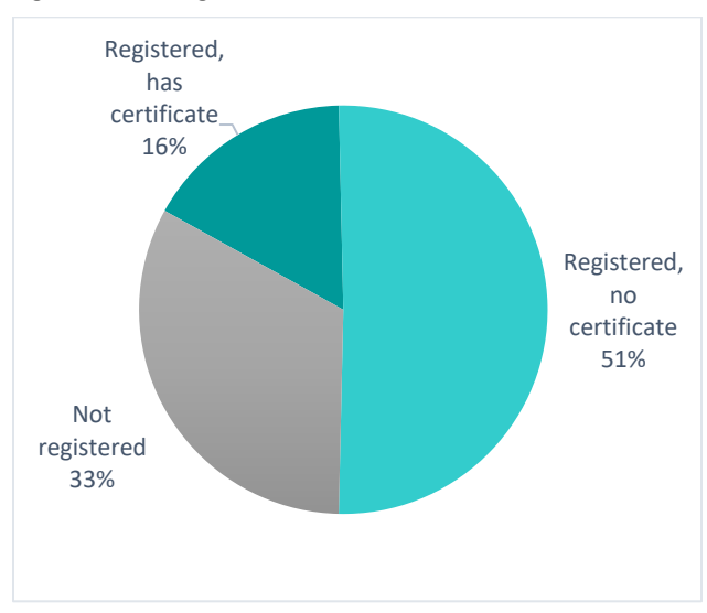
Figure 1: Birth registration status: Malawi, 2015/16