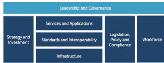
Figure 2. Components of the WHO-ITU eHealth Framework