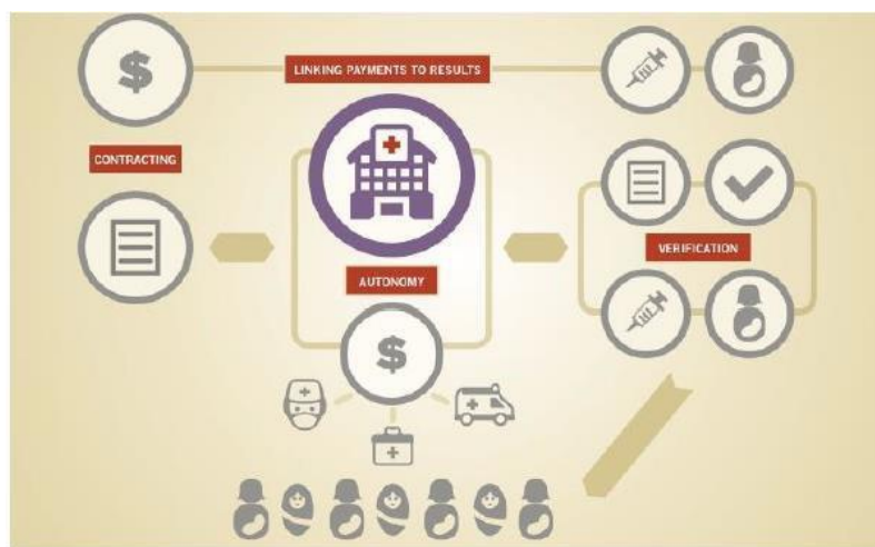
Figure 1: Linking payments for results

Several elements underpin RBF programs (Figure 1), with three of them playing the most important role: