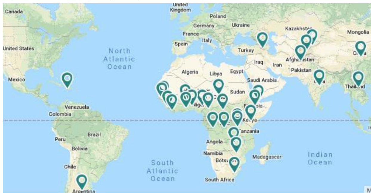
Map 1: Countries with RBF projects supported by HRITF

RBF designs are influenced by country context and adjusted over the years based on lessons learned during implementation and based on evolving sector priorities. A large majority of the projects seek to generate supply-side improvements using RBF at the health facility level. Over time, several of these designs have evolved to address identified bottlenecks; most RBF programs now include administrative indicators or disbursement-linked indicators. For instance, programmatic designs now frequently enhance timely verification and supervision or focus on health system strengthening such as increasing the availability of medicines and commodities. Results from the initial impact evaluations indicate that demand- and supply-side incentives work on different margins, suggesting they may be even more effective when combined. To this end, some countries have integrated supply-side incentives with community level RBF interventions or voucher programs to enhance demand. For sustainability purposes, some countries also use social health insurance systems as part of their RBF designs and implementation. To date, six countries are now implementing nation-wide RBF programs (i.e. Afghanistan, Armenia, Benin, Burundi, Sierra Leone, and Zimbabwe).